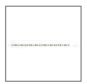
K-1091-24V K-1091-24 Ref. arch K-1091-24V