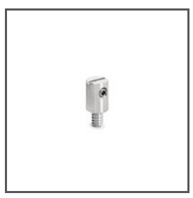
FASTENER LIN C28178N00 Ref. arch 42294