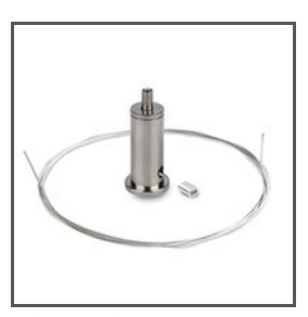
FASTENER SET RG-1 C28230P00, C28230P01, C28230L10, C28230L07 Ref. arch 42647NI, 42647GSS, 42647L9010, 42647L9005