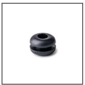
GLAND 6x1,2 C24517C07 Ref. arch 00802