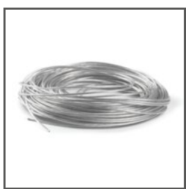
WIRE FI-1,35mm Z70310 Ref. arch 70310