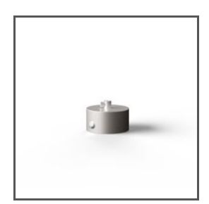
CANOPY Fi-60mm C24540