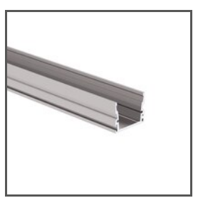
HR-MAX-T A01827 Ref. arch C1827