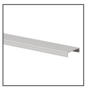
PROTECTIVE INSERT TECH-35 C24534C02 Ref. arch 17127