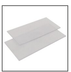
DISASSEMBLY PLATES PK-4 Z70261 Ref. arch 70261