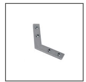
CONNECTOR ZM-NA-120 C28242N00 Ref. arch 42729