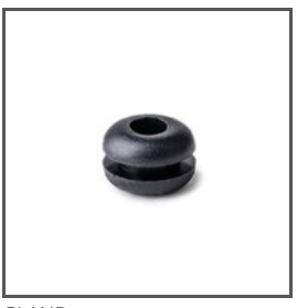
GLAND 6x1,2 C24517C07 Ref. arch 00802