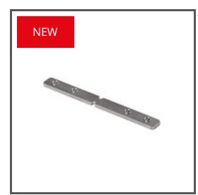
CONNECTOR ZM-180 C28075N00 Ref. arch 40693