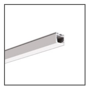
OPK-4 A00370 Ref. arch C0370